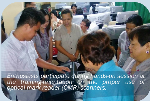
Enthusiasts participate during hands-on session at the training-orientation on the proper use of optical mark reader (OMR) scanners.