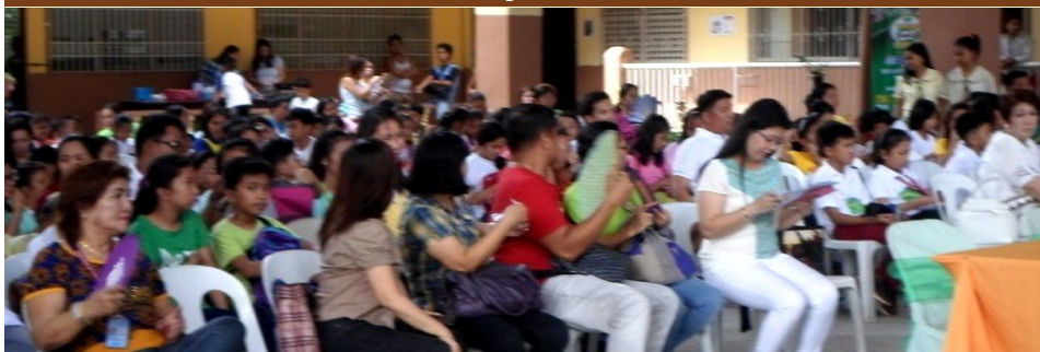
YES-O participants attentively listening during the opening program

SDO-Lucena City Youth for Environment in Schools – Organization (YES-O) in partnership with the Department of Environment and Natural Resources (DENR), Department of Science and Technology (DOST), Tanggol Kalikasan, and Lucena City Government conducted its 9 th Division YES-O Environmental Brigade and Science and Technology Week with the theme “ Juan Science, Juan Nation ” on July 29 at Lucena East I Elementary School.