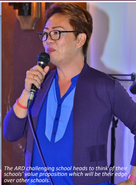
The ARD challenging school heads to think of their schools' value proposition which will be their edge over other schools.