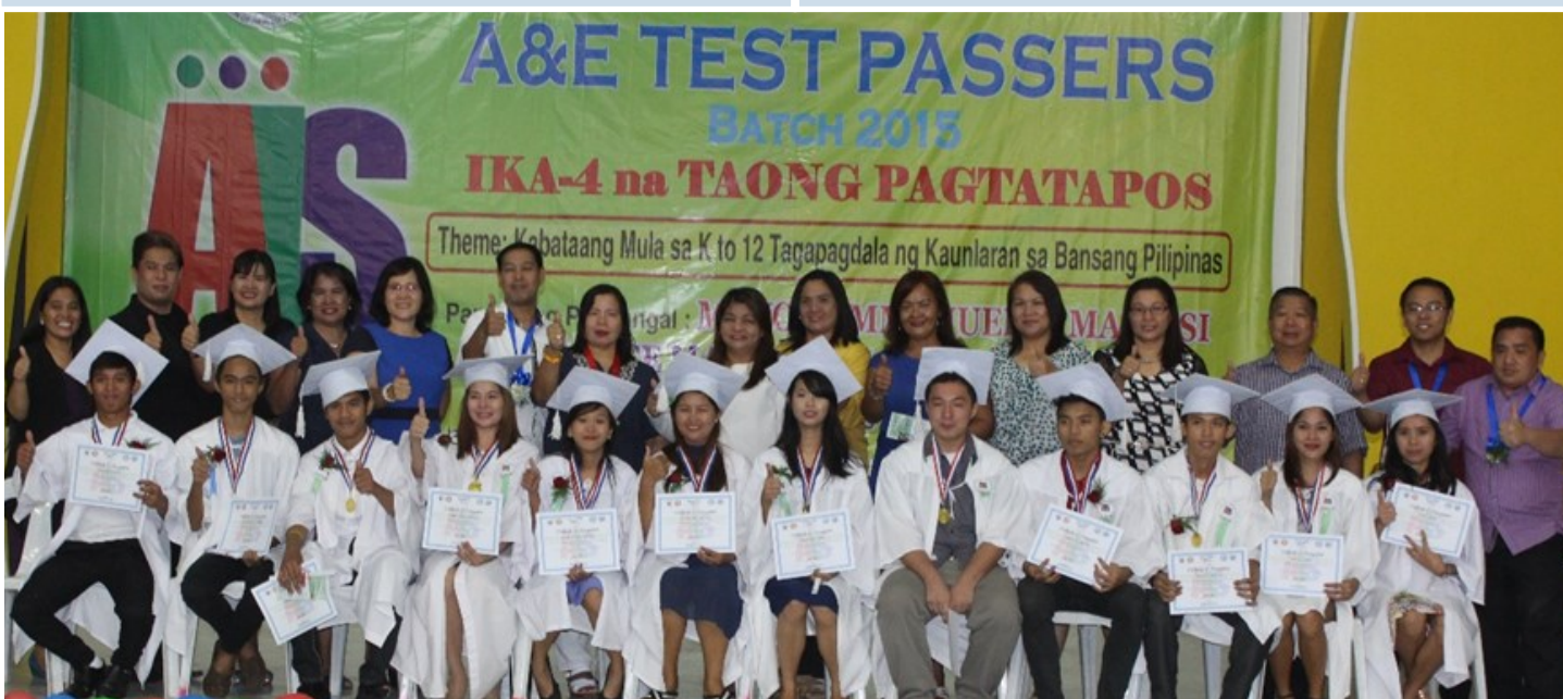
Nagpakuha ng larawan ang pamunuan ng Schools Division of Imus City Alternative Learning System kasama ang mga ALS A&E Test passers na nakapagtala ng pinakamatataa na marka